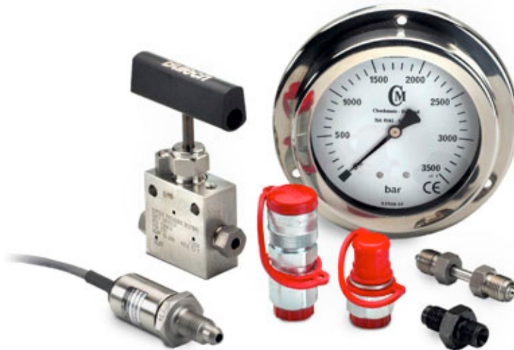
High pressure fittings