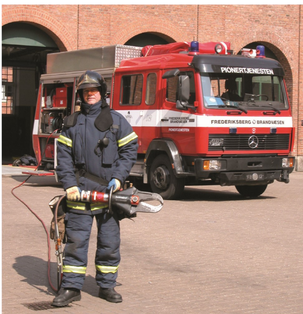
Tools can be operated 40 meters away from Rescue truck with help of hoses.

With help of miniBOOSTER hydraulic pressure intensifiers you can vastly improve the power capabilities for rescue tools on your rescue vehicle, and save space and speed up operation in the process. The Power Take Off can be boosted to 700 bar, providing a reliable, fast and quiet high-pressure source, eliminating the need for extra power packs. The rescue personnel will enjoy getting rid of hassle working with the heavy petrol-driven power packs.