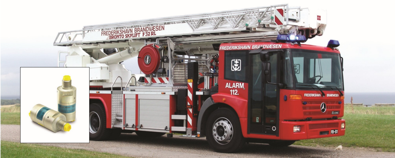
HC2 can easily be installed on a vehicle and is capable of delivering flow to 2 tools.