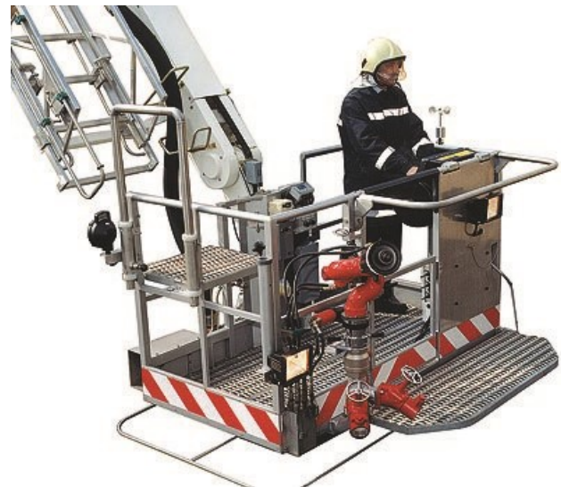
HC2-4-0-A-1 saves weight and space in the skylift.