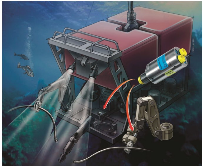
ROV Subsea work takes a hard toll on equipment.

The HC6D2W offers an excellent weight/space performance ratio for dual media takes like high-pressure water jetting, seal testing and methanol injection.