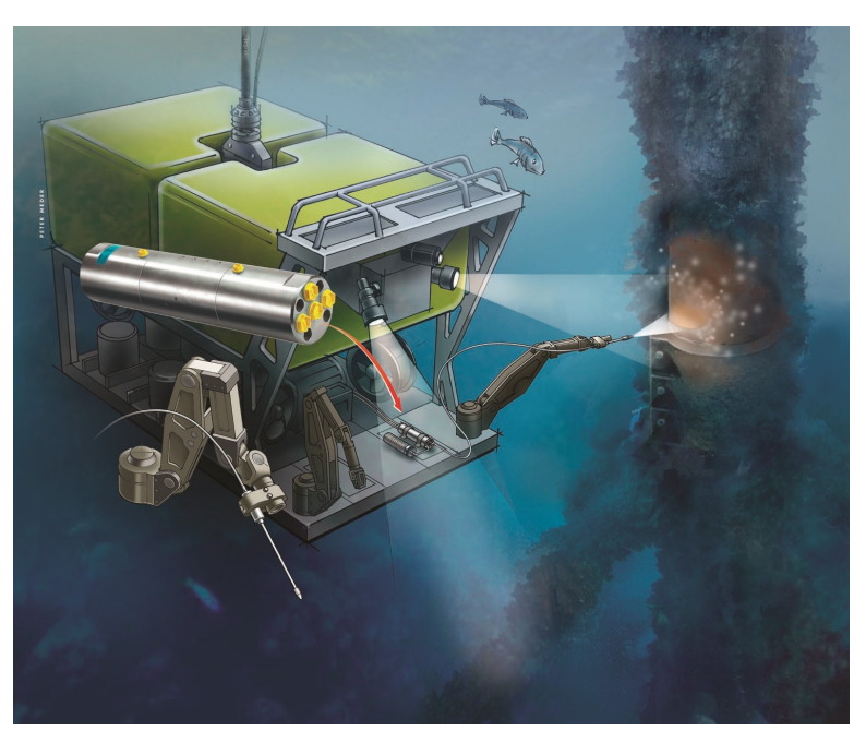
ROV high pressure water jet cleaning system.